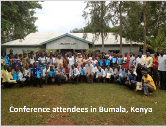
Conference attendees in Bumala, Kenya