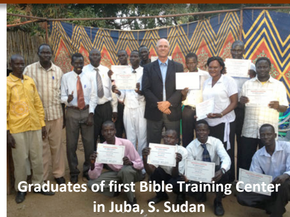
Graduates of first Bible Training Center in Juba, S. Sudan