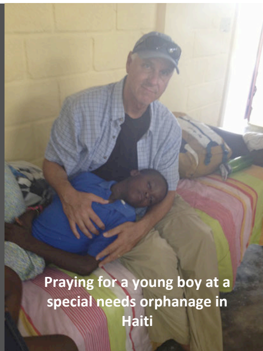
Praying for a young boy at a special needs orphanage in Haiti

So many people desperate for prayer and healing