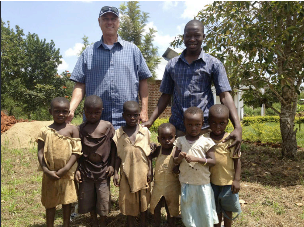
Precious children in a village outside of Bumala, Kenya

Train leaders. Disciple the nations. Reach the lost. Set captives free. Love on people, one person at a time, one day at a time.